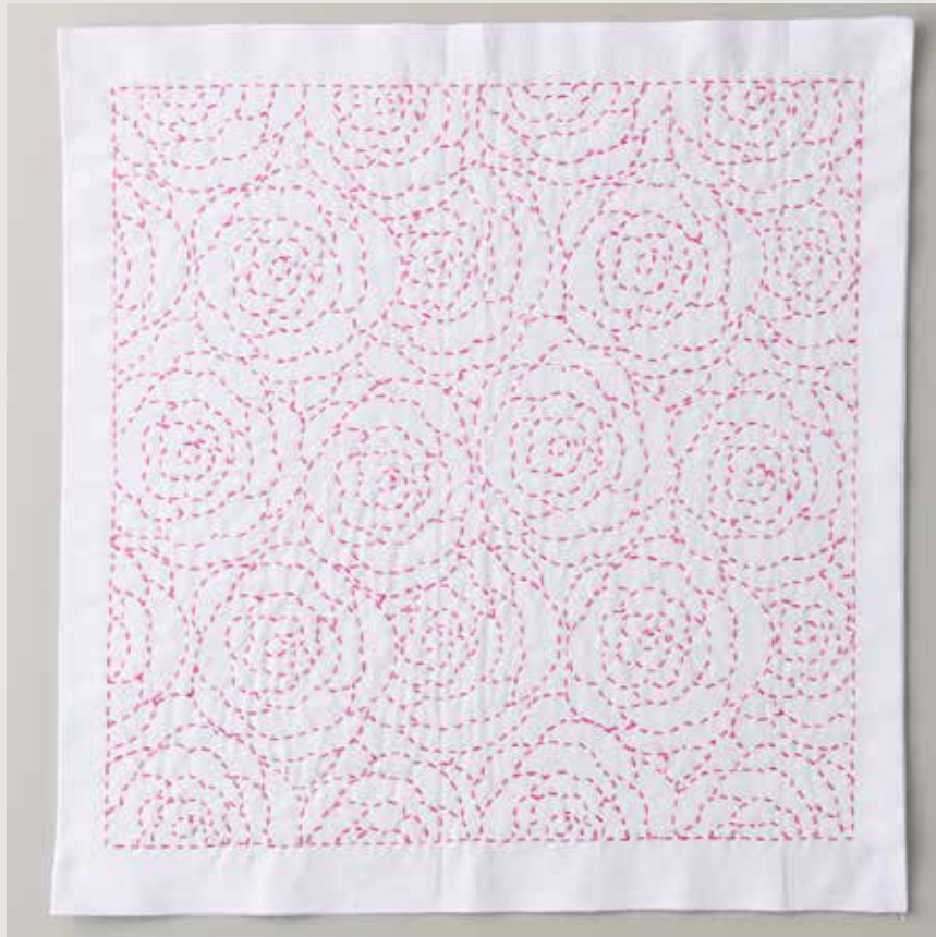
Finished size : Approx. 33 cm x 33 cm (square)