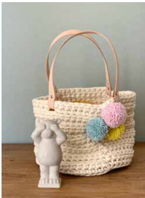
Designed by Maria Atelier