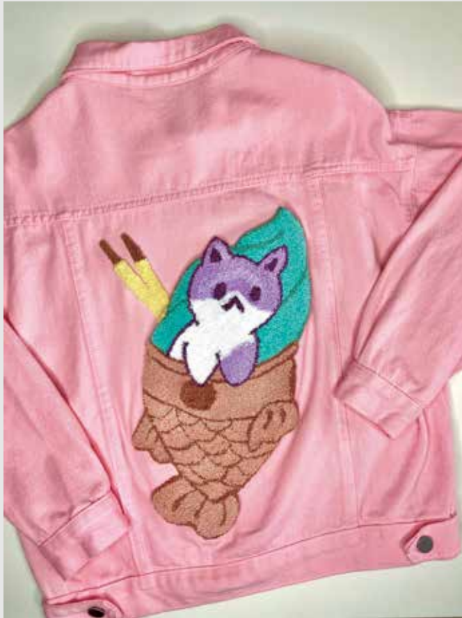
Finished size : approx. 24 x 35 cm Designed by YUMI HOOPS