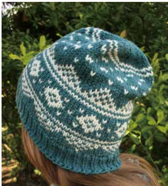
Designed by Rosee Woodland