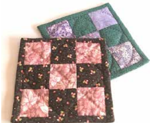
Designed by Satsuki 'MAY' Okamoto