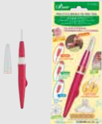
• Pen Style Needle Felting Tool (Art No. 8901)