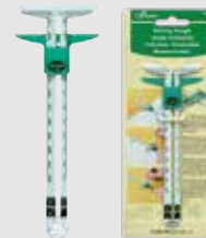
• Sliding Gauge (Art No.7706)