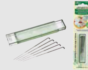
• Needle Felting Tool Refill Needle (Art No. 8905)