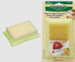
• Needle Felting Mat (Large)(Art No. 8911)