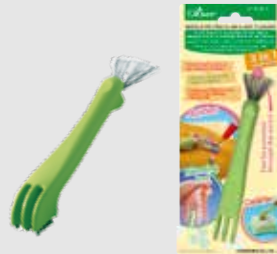
• Claw and Mat Cleaner (Art No. 8919)