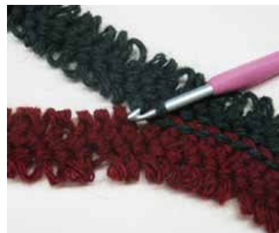
Overlap each loop with next loop of opposite strip.