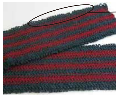
Leave the loops on the edges.