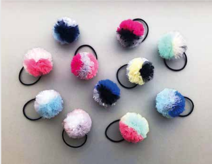
Finished size : approx. 55mm