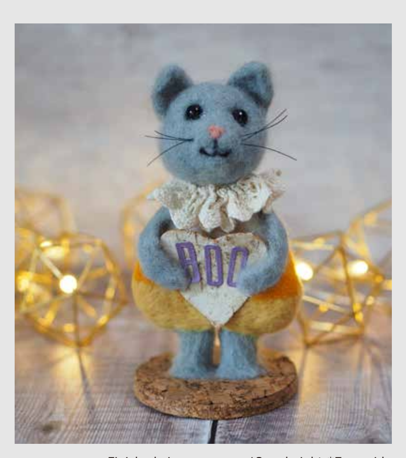
Finished size: approx. 13cm height *7cm wide Designed by Debbie von Grabler-Crozier