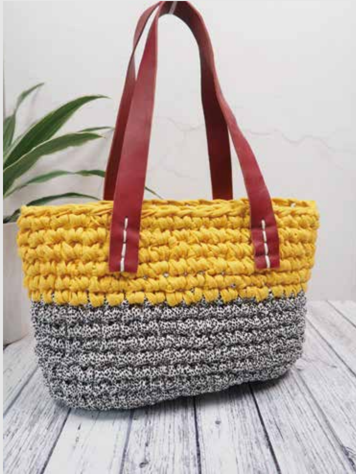
Finished size : approx. 19cm height *26cm wide Designed by Debbie von Grabler-Crozier