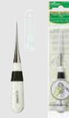
• Straight Tailor' s Awl (Art No.485/W)