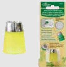
• Protect and Grip Thimble (Art No. 6027)