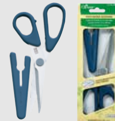
• Patchwork Scissors (17cm) (Fine) (Art No. 493)