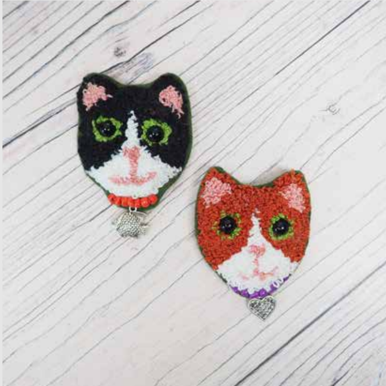
Finished size : approx. 3cm height *2cm wide Designed by by Debbie von Grabler-Crozier