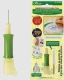
• Embroidery Stitching Tool (Art No.8800)