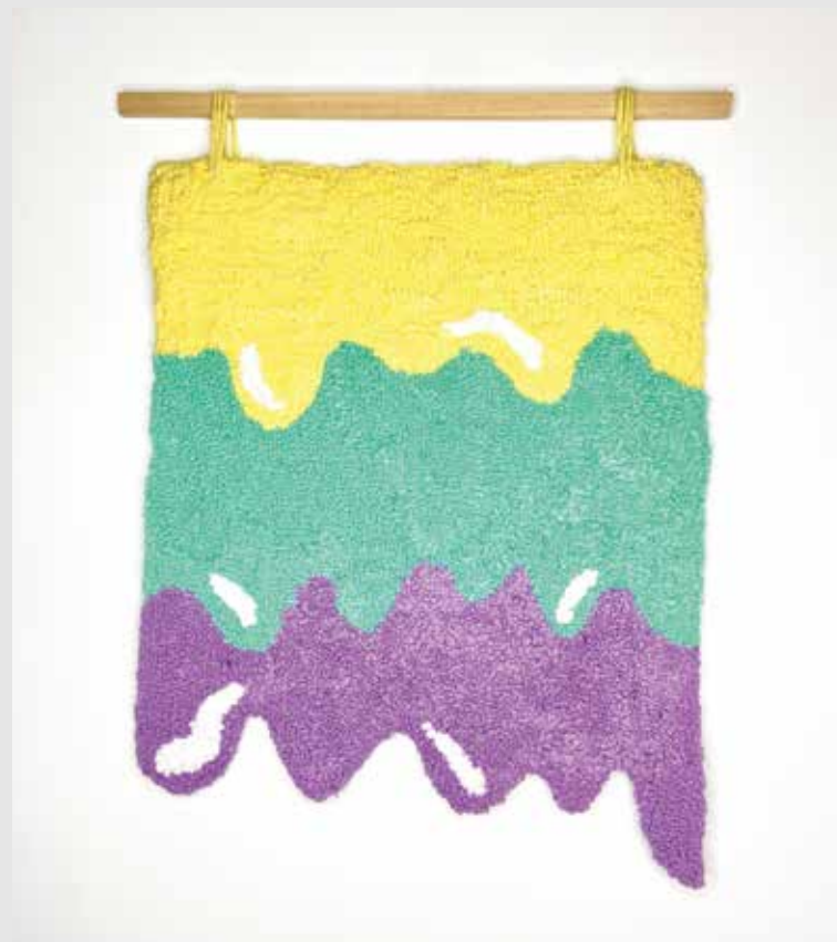
Finished size : approx. 49cm height *38cm wide Designed by YUMI HOOPS