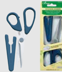
• Patchwork Scissors (Art No. 493)