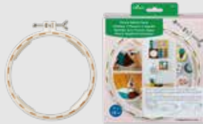
• Punch Needle Hoop (Art No. 8817)