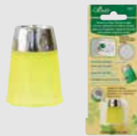
• Protect and Grip Thimble (Large)(Art No. 6027)