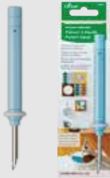
• Punch needle (Art No.8816)