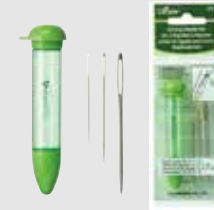
• Darning Needle Set (Art No.339)