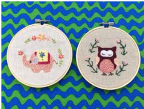
Designed by Sachiyo Ishii