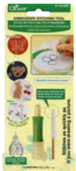
Embroidery Stitching Tool