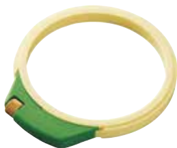
Clover Embroidery Hoop (12 cm)