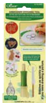
Embroidery Stitching Tool