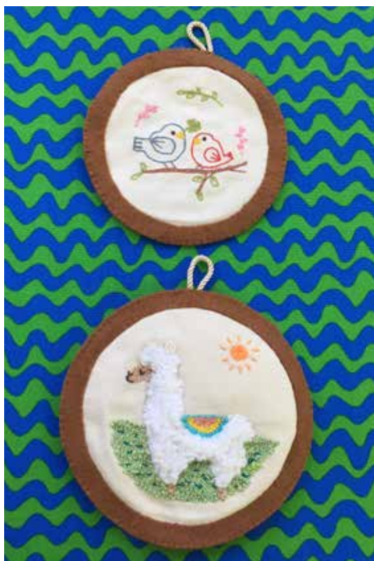
Designed by Sachiyo Ishii