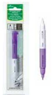
Air Erasable Marker with Eraser <Purple Fine>