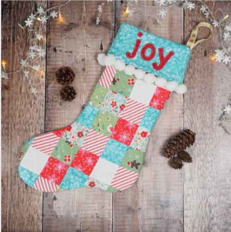
Finished size; 27cm length *43cm height Designed by Debbie von Grabler-Crozier, The Folk Art Factory