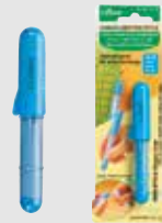
• Chaco Liner Pen Style (Blue)(Art No.4710)