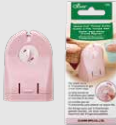
• "Quick Cut" Thread Cutter (Art No.7490)