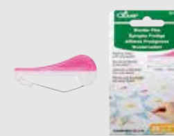
• Wonder Pins (20 pcs.) (Art No. 3210)