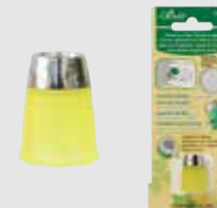
• Protect and Grip Thimble (Large)(Art No.6027)