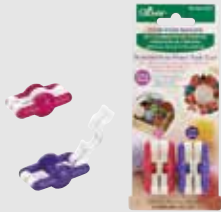
• Pom-Pom Maker (Extra Small)(Art No. 3127)