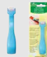
• Roll & Press (Art No. 7812)