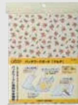
• Patchwork Board "MULTI" •mm Gauge(Art No. 57-872)