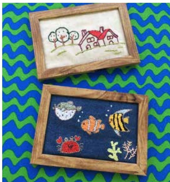
Designed by Sachiyo Ishii