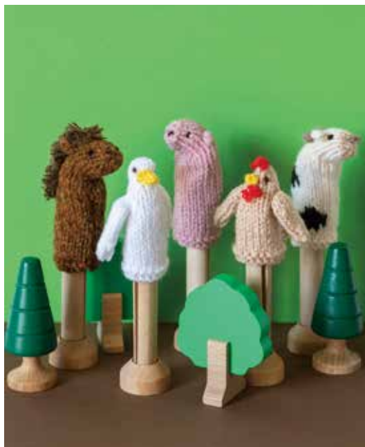
Designed by Sachiyo Ishii