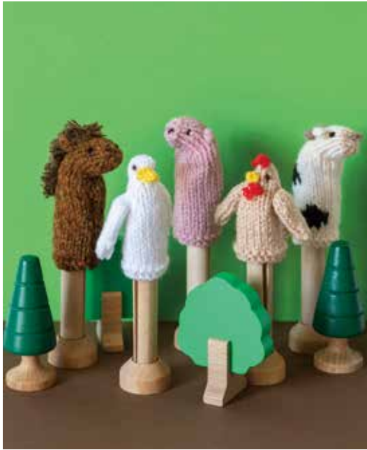
Designed by Sachiyo Ishii