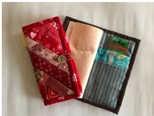
Designed by Satsuki 'MAY' Okamoto