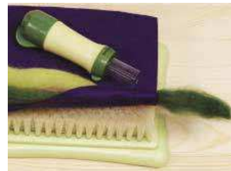
Felt Wool with Needle Felting Tool