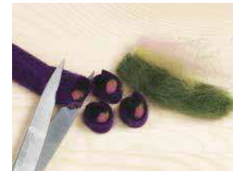
Cut Small Pieces and Decorate