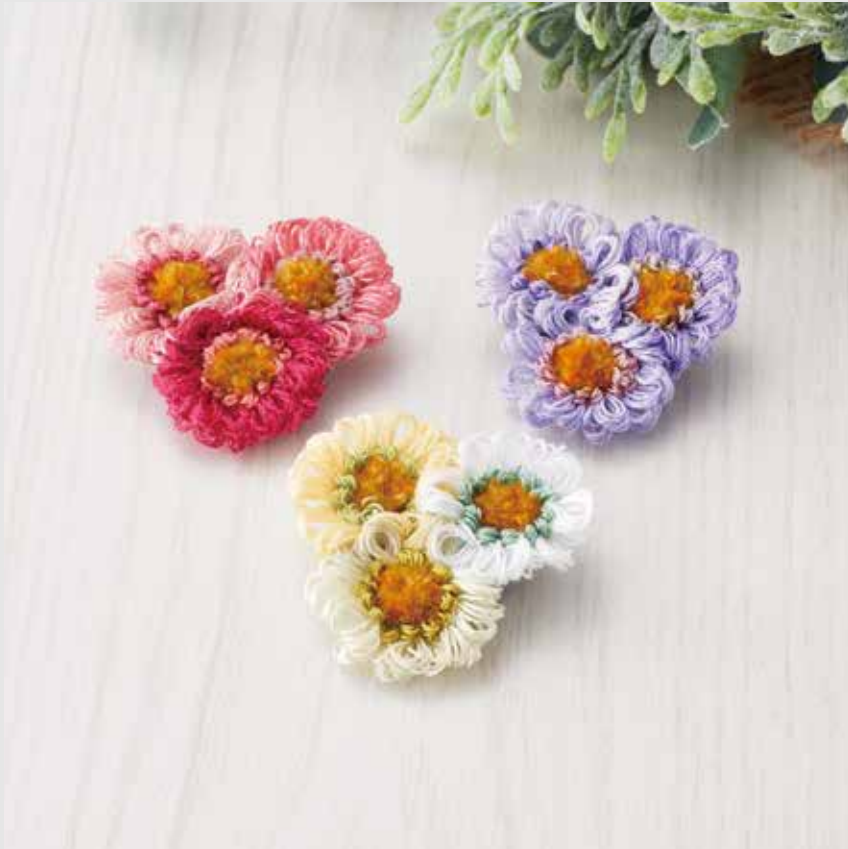
Finished size : approx. 3.5cm height *3.5cm wide Designed by Mayumi Yonenaga