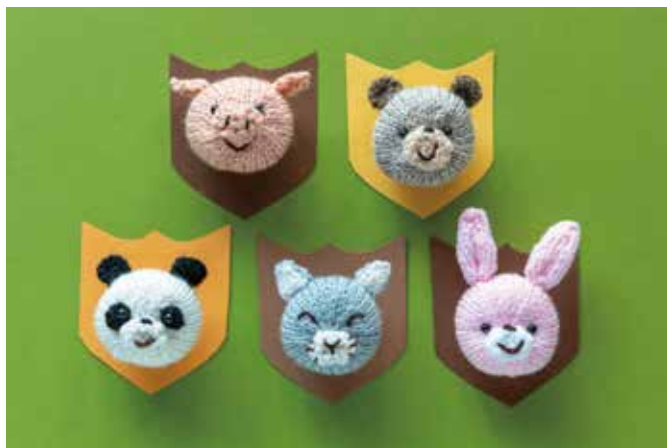
Designed by Sachiyo Ishii